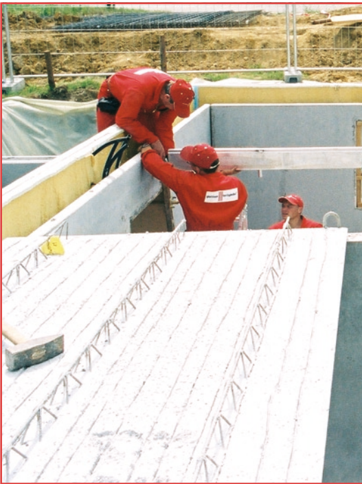
Glatthaar ThermoSafe® Basement