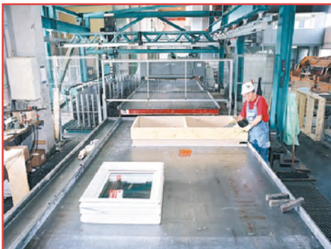
3 Various components can be included (windows, pipes, sockets, etc.) ...