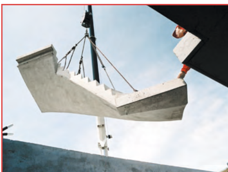
6 Staircase with winders placed in position ...