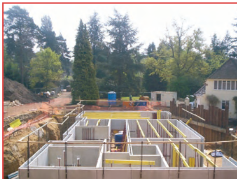
4 Temporary ground floor support placed in position ...