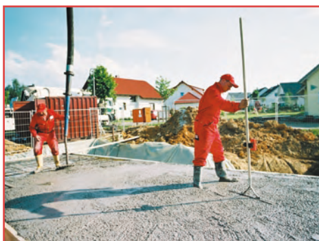
7 Concreting Twin Wall cavities and ground floor slab ...