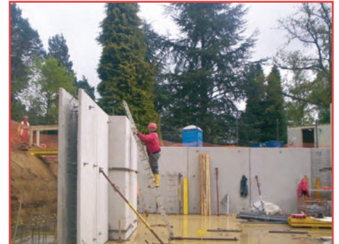
2 External Twin Walls erected ...