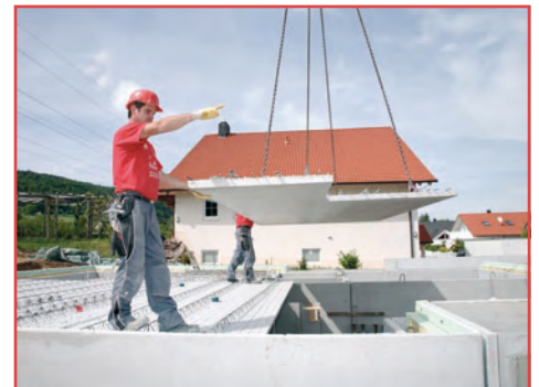
5 Precast ground floor slab installed ...