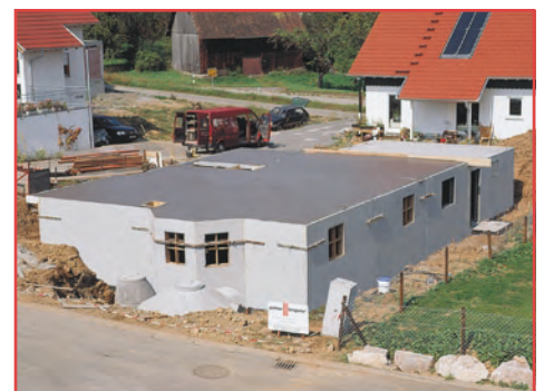
8 Complete – ready for superstructure.