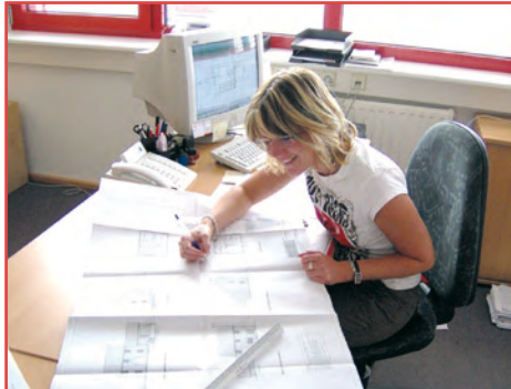
1 CAD led process ...