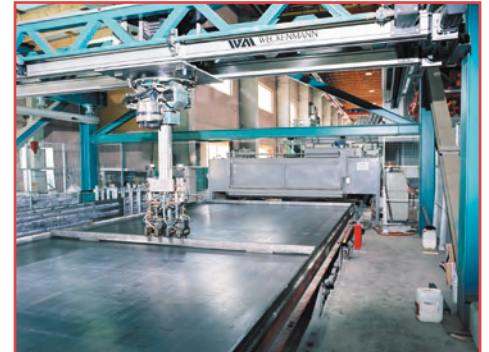
2 Setting out panel ...