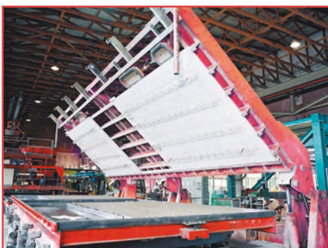
6 External wall – joining of internal and external leaves ...