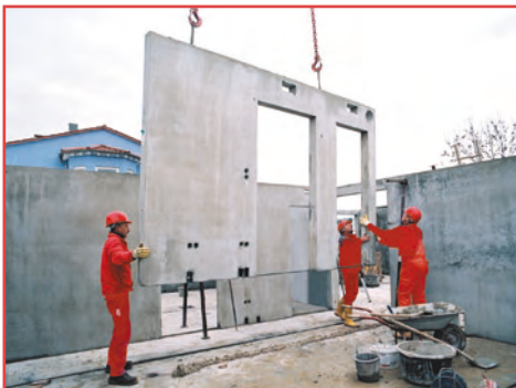
3 Internal Walls erected ...