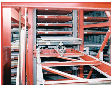
7 Heated curing chamber ...