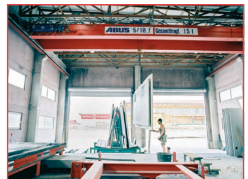
8 Ready for site delivery ...