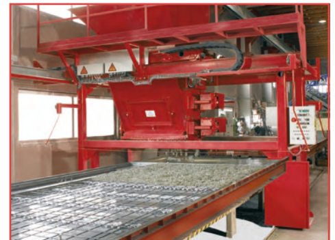
5 Automated concreting ...