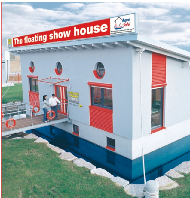
The floating show house with a Glatthaar AquaSafe